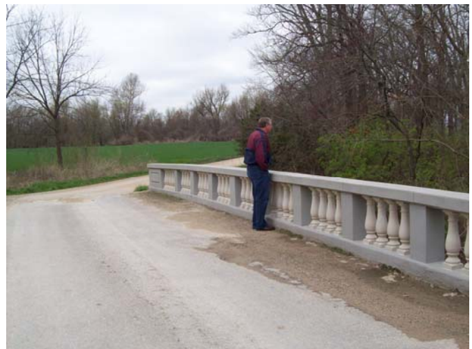
Wagon Wheel Bridge located just south of Gerth Cabin, Greeley, Kansas.