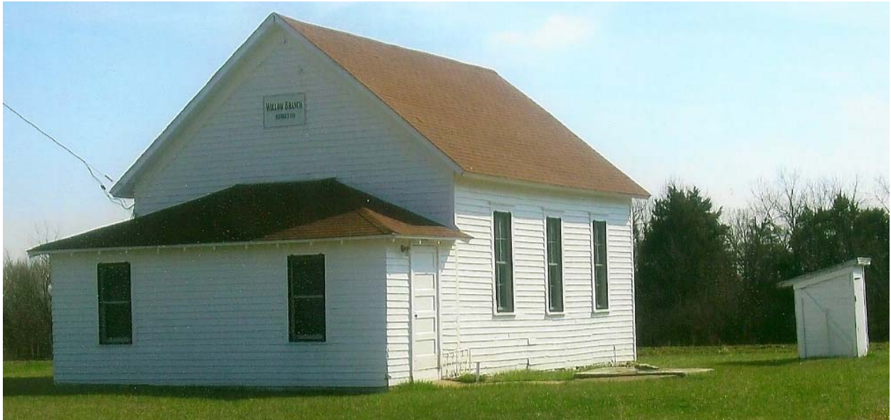
Willow Branch School