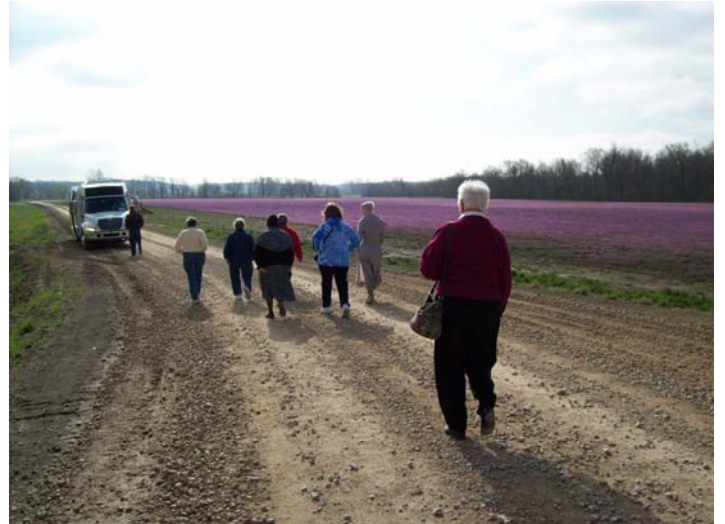
We dare YOU to "Do Dirt" in Kansas, even if by tour bus!