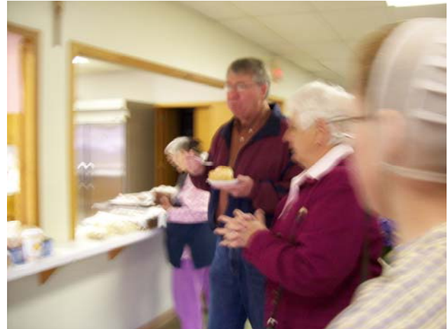
Bake Sale at St. John's Hall during Greeley City Wide Garage Sale