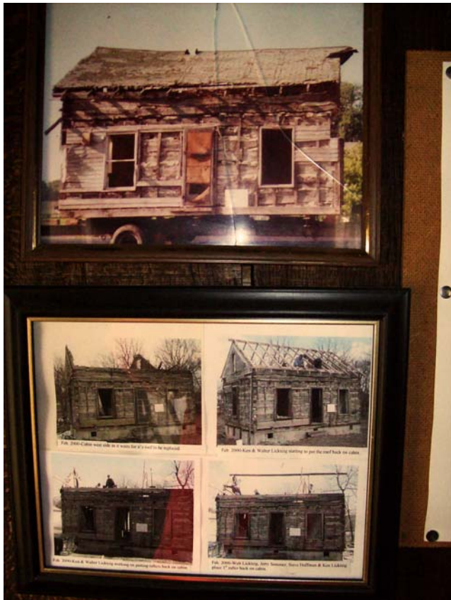
“Before” restoration of the 1856 Gerth Cabin ...