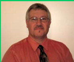
Greg A. Gwin, Commissioner